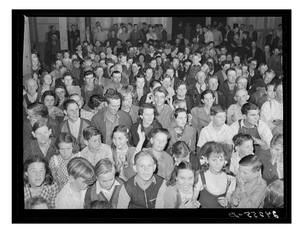
Audience watching play given by Arvin camp. Tulare FSA camp, Visalia, California.

The FSA camps, and the role of this Federal agency in the lives of so many people, is little known today. But the legacy of the FSA continues to influence our culture through the project for which it is perhaps best known today: the photographic project of documenting the lives of the rural poor, which became a major influence in how people perceived the Depression. Hundreds of thousands of photographs were created by such noted photographers as Dorothea Lange, Walker Evans and Gordon Parks. The 164,000 images that have survived have been published online by the Library of Congress.