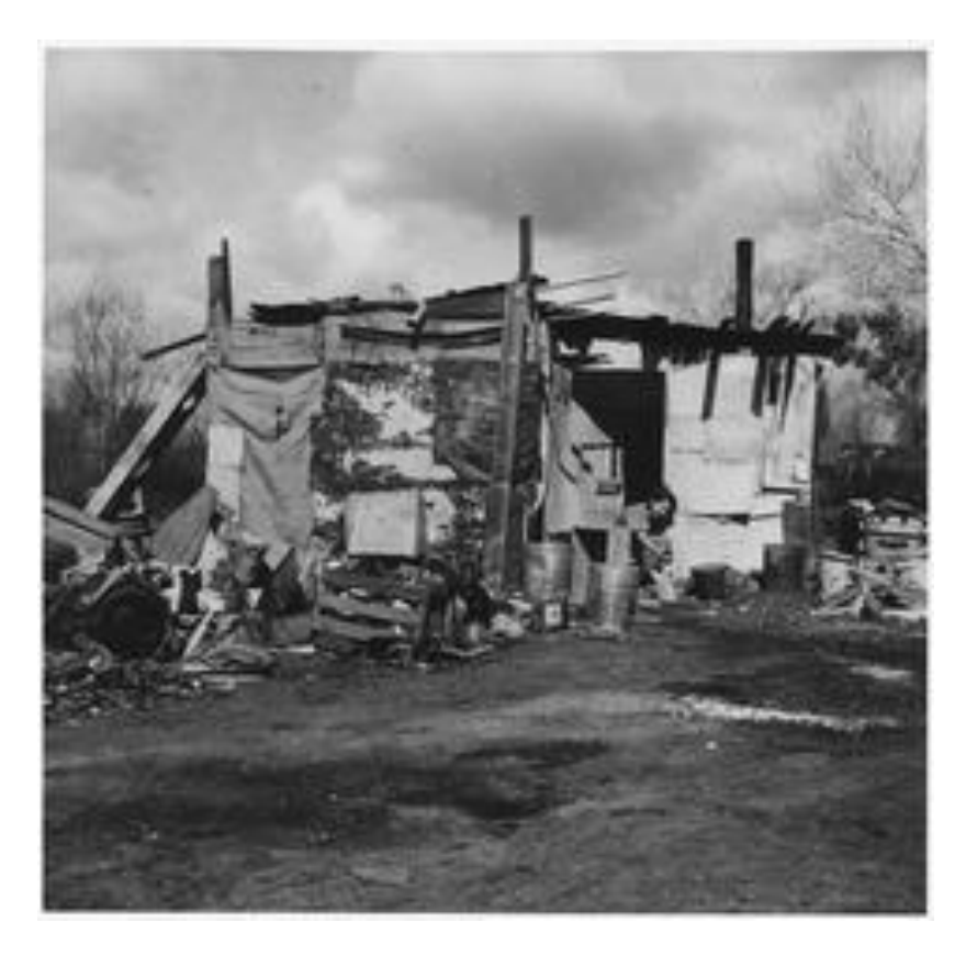
Arkansas squatters, three years in California. Near Bakersfield, California

California was by no means the Promised Land for the migrants. Although the weather was better, and the agricultural season longer and more varied, the Depression had hit California as well. Wages for California farm workers had never been high, but during the Depression they plummeted, in some cases to less than a quarter of pre-1929 levels, and the arrival of the Dust Bowl refugees depressed wages even more. Families were unable to support themselves even with all their members working in the fields, and were reduced to living in roadside squatters' camps or "ditchbank camps" next to farmers' irrigation ditches.