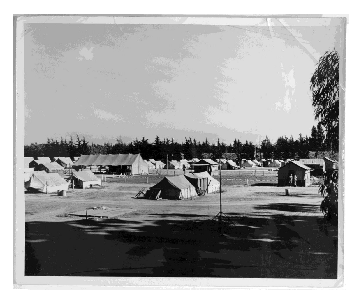
Migrant camp, wide shot.

Despite the improvement in their living situations, there were still many factors causing conflicts among the workers at the camps. Living in close quarters with people of different backgrounds caused social strains. There were divisions based on religion, class, and politics. Labor strikes drew lines between strikers and strikebreakers.